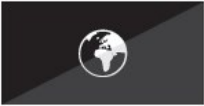
Global monitoring of all AV devices

Multiple ZU510T's can be monitored over LAN and also provide the user with an email message alert in case an error occurs or a light source fails or needs to be replaced, using Crestron RoomView. While the web browser interface and full support for Extron's IP Link, AMX dynamic device discovery and PJ-Link protocols, allow almost all aspects of the ZU510T to be controlled across a network, keeping you in control, wherever you are.