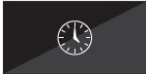
Track projector light source usage