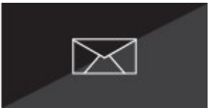
Email alerts and instant notifications - help desk requests, service reminders, device failure or theft